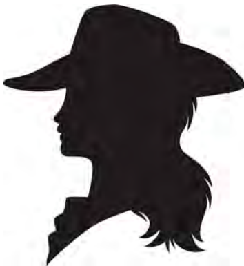
Teres is a little camera shy!

Expectations for the 2019 Bonina Colt Cow Connection: "No big expectations. My goal is to get to know the horse and get a read on what they need from me to help them have a successful connection to the cow."